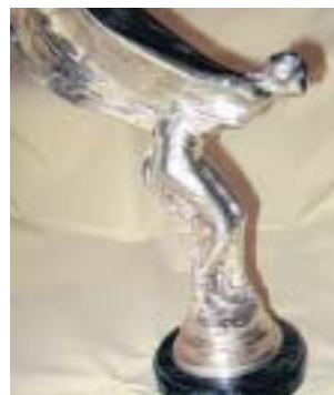
ROLLS ROYCE FLYING Lady mas- cot in solid bronze finish, silver or bronze, 12" height on marble base. £125 inc p&p. Also 15" available. Tel 0208 399 7541 (Surry)