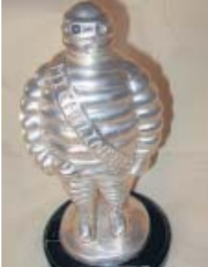
MICHELIN MR BIBENDUM Man, solid bronze on marble base, 10" height, excellent condition, £125 inc p&p. Tel 0208 399 754 (Surrey)

PETROL PUMPS, GLOBES and fore- court items, pre 1960's, wanted by genuine collector. Tel 01736 754810